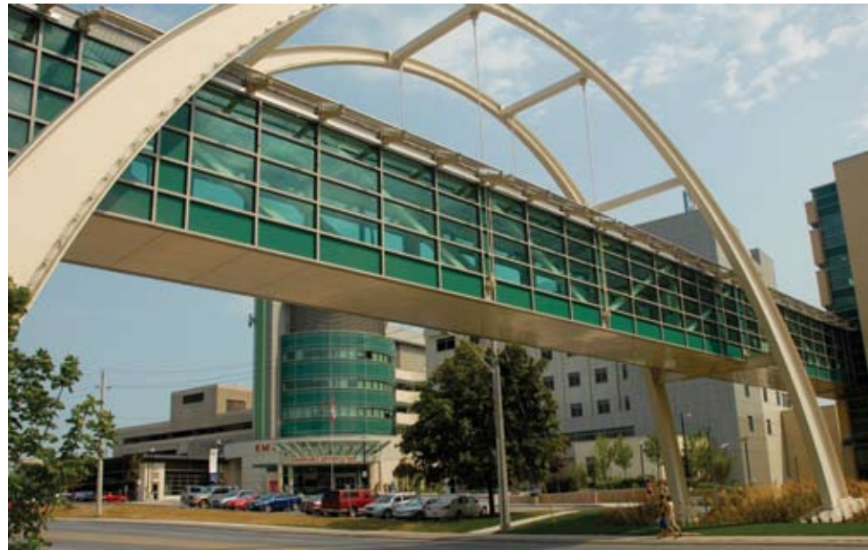
Newmarket's rapidly expanding health sector is identified as a significant economic driver and employment generator within the town's economic development strategy.

In the last 30 years, Newmarket has experienced a boom in growth, propelling the town's population from 26,000 in 1978 to approximately 84,000 today. Year after year, new subdivisions were built across the town and the residential community flourished