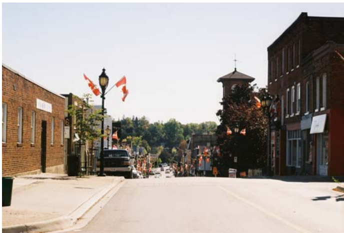
View from crest of hill, looking south

The public is invited to an informal open house to view a display of maps and photographs, watch a video about the experience of property owners in heritage conservation districts, and ask questions of Town staff and consultants. Formal presentations begin at 7:00 p.m. At 8:00, there is a workshop to answer questions about district designation and to consider the objectives of designation for Lower Main Street South. Public comment will be recorded. An opportunity to speak further to Town staff and consultants follows the meeting.