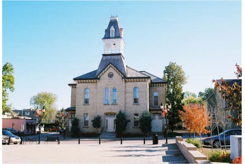
Old Town Hall, 460 Botsford Street

In its policies and programs, the Town has aimed to revitalize Lower Main Street South while preserving its historic character. Designating the lands along and near Lower Main Street South as a heritage conservation district formally recognizes the area's historic value, ensures its long-term conservation, and permits its gradual improvement according to a plan developed in consultation with the district's property owners, business owners and residents.