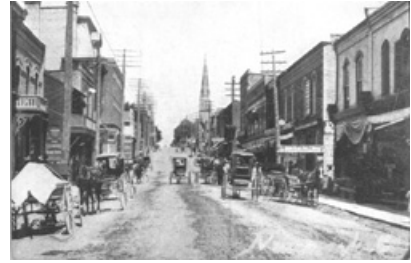
Main Street Newmarket, 1890s

Newmarket has always been a market town. That's why its Main Street is considered the heart of the community. The Town was founded as a trading post and milling centre in 1801 where the river cuts the old native trail (Water and Main Streets).