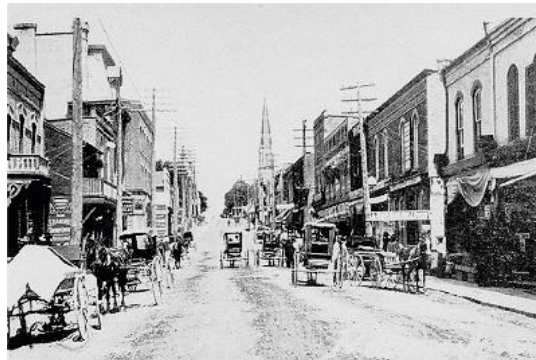
Main Street, 1890*