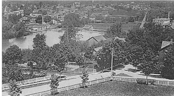
Panoramic View of Newmarket, 1911*