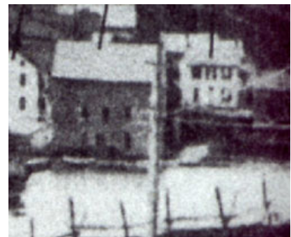
Original Hill's Mill, Main and Water Streets, 1801