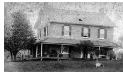
Bogart Farm House, Mullock Drive, 1890s