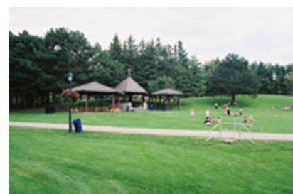
Fairy Lake, 2004

Newmarket's numerous parks and recreational facilities offer a wide range of activities for all ages, from exercise programs to microwave cooking, summer day camps and P.A. Day activities for youngsters, or simply the quiet enjoyment of a stroll through Fairy Lake or one of our passive parks. Many community groups and sports associations make use of the community centres and