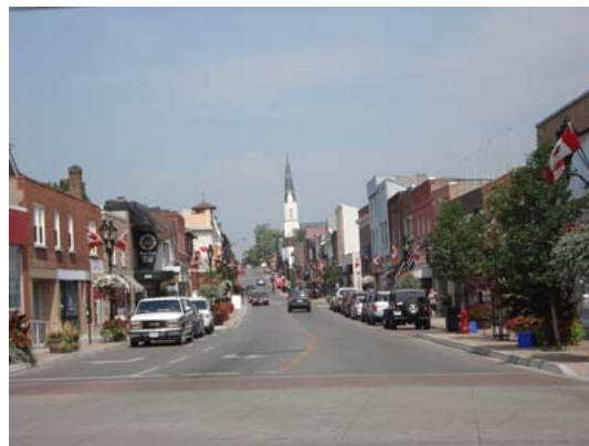
Main Street, 2008