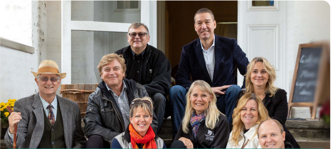
Members of Council at Mulock Harvest Picnic in 2019